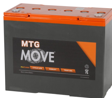
Pictured: M6 terminal